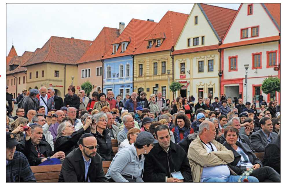
Bardejov, Solvakia Town Square.

On May 14-17, 130 people commemorated the 70<sup>th</sup> anniversary of the depor-tation of the Jews of Bardejov, Slovakia, in 1942. (See article on page 46.)