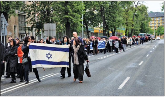
The Bardejov, Slovakia Solidarity Walk on May 15 closed down the main street for the first time in the city's history.