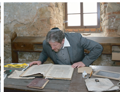
Israeli Ambassador in the Memorial (left) and in the Old Synagogue (right).