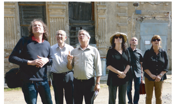
Evaluating Beith Hamidrash inside the Jewish Suburbia complex.